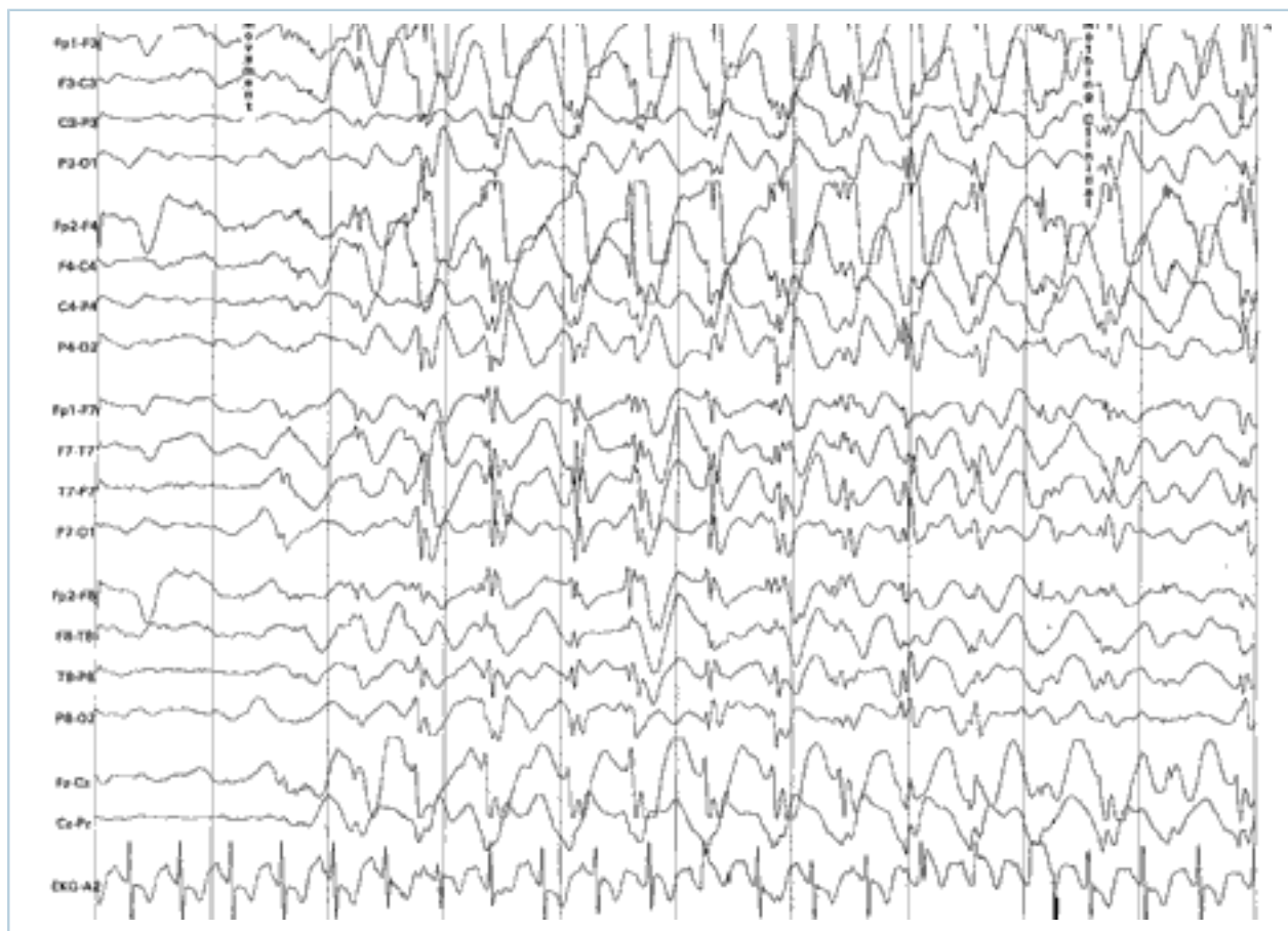
Slow (<2.5 Hz) generalised spike-and-wave on EEG associated with atypical absence seizures and Lennox-Gastaut syndrome