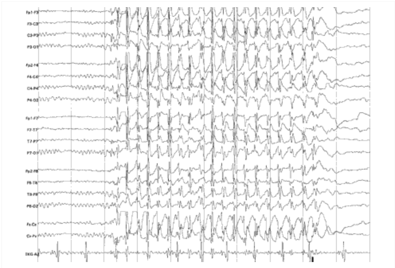
Figure 1: 3 Hz generalised spike-and-wave pattern on EEG pathognomonic for typical absence seizures and childhood absence epilepsy